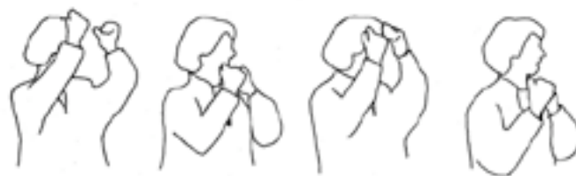
Fig. 4. S4: "The Earth has more pull on you."