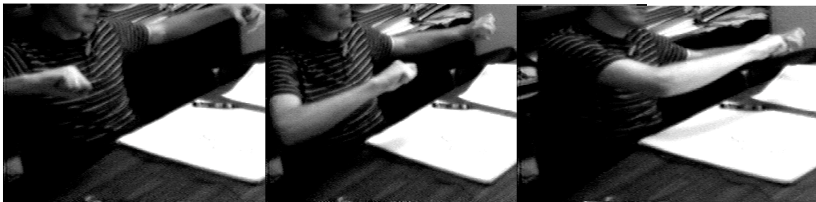
Figure 2 a, b, c. Extreme case comparison gestures for twisting a rod.

A hypothesis that explains the process underlying this extreme case is the following. Given the above observations, it is plausible to interpret this process as “imagery enhancement” (or “simulation enhancement”)—that the role of this extreme case is to enhance the subject’s ability to run or compare imagistic simulations with high confidence.