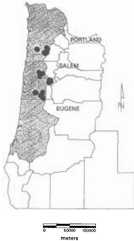
Figure 1. The Coast Ranges (shaded area) of western Oregon and areas (circles, which may represent \geq 1 survey blocks) surveyed for Northern Goshawks during June-August 1994.

Wight 1978, Reynolds et al. 1982). No one has conducted systematic searches for goshawk nests in the Coast Ranges since, and no one has used broadcasts of goshawk vocalizations to survey for the presence of breeding pairs over large areas of the Coast Ranges (Woodbridge, USDA Forest Serv. unpubl. rep. 1990; Kennedy and Stahlecker 1993). Herein, we report results of a study conducted to document the presence of breeding Northern Goshawks and to assess vegetative conditions that might influence their distribution in the Oregon Coast Ranges.