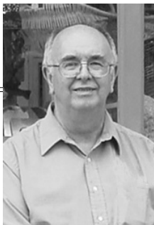
James Rachels (1941-2003)

3. Another argument against Egoism, from James Rachels