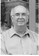
James Rachels (1941-2003)