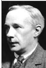
G. E. Moore (1873-1958)

1. Another theory comes from G. E. Moore