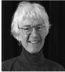
Derek Parfit (b. 1942)

5. One such argument comes from Derek Parfit: