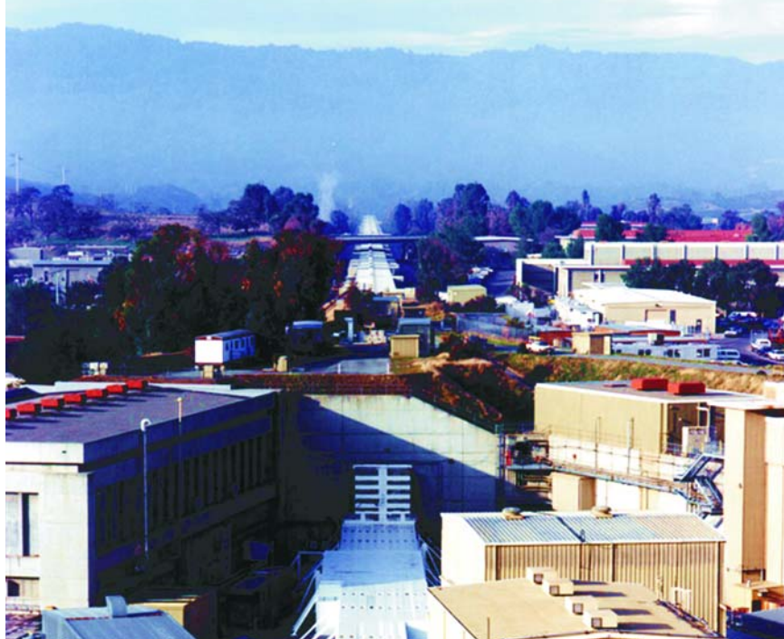
Figure 3. After four decades of housing targets and detectors for particle physics, the experimental area (foreground) at the downstream end of SLAC's 3-km-long electron-positron linac (seen receding toward the hills) will soon give way to the Linear Coherent Light Source, an x-ray beam facility for condensed-matter physics, materials science, and biology. The free-electron laser that generates the x rays will be fed by electrons from the linac.

standard deviation of the standard-model prediction. And it demonstrates the anticipated running by being more than six standard deviations above the precisely measured anchor point at Q = 91 GeV, the Z^0 mass.