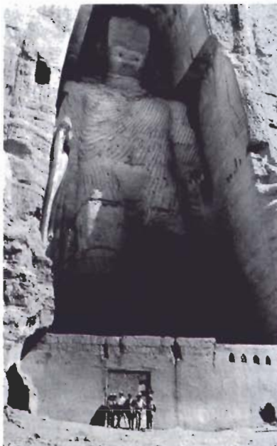
GONE. A 1931 photo shows one of two giant Buddhas at Bamiyan, Afghanistan. The Taliban destroyed both in 2001 (right), underscoring the risks facing priceless antiquities in unstable lands.